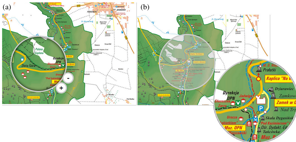
Fig. 2. From left: fragment of touristic map of Ojców National Park presented in window of interactive lens (jfMagnify) – extended by navigation buttons (a) and presented in an independent window (b), screenshot.

Another interesting solution is a script, which is also prepared on the basis of jQuery JavaScript and meaningfully called MagnifierRentgen (jQuery MagnifierRentgen Plugin) [9]. While the other tools use one raster file, which is scaled straight in a browser window, MagnifierRentgen can present in a lens’s window any other raster file. This may have considerable significance for component efficiency because primarily in that case there can be downloaded a map, which can be prepared in a high extent of generalisation, i.e. with less detail that is less size in pixels, which, in turn, results in less number of data transferred by the Web. Some sort for round lenses are these, which realize approximation of a map’s view in a window taking the shape of a polygon – adjacent or directly in the area of map’s presentation. Easy Image Zoom jQuery Plugin can serve as an example [10].